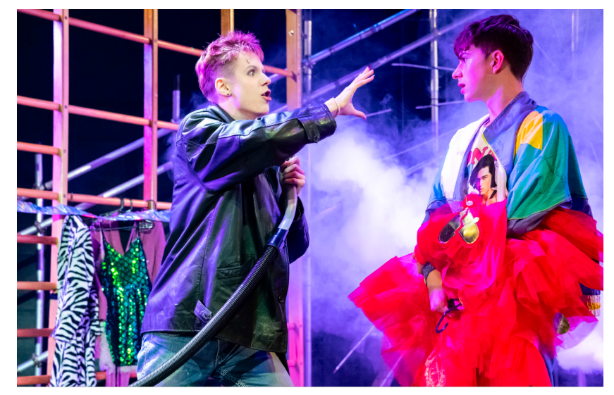
CTC's Everybody's Talking About Jamie: Teen Edition

We apologise that the original information on Facebook stipulated an age range from 8-18 — we have subsequently confirmed that our licence stipulates 9-18. We apologise for any inconvenience that this may have caused.