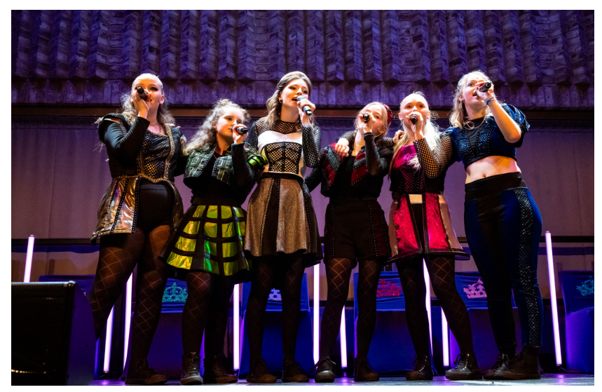
CTC's Six: School Edition

You will need to be a member of Cambridge Youth Theatre by CTC to apply for an audition. You can read more about joining our youth membership scheme at www.cambridgeyouththeatre.org.uk