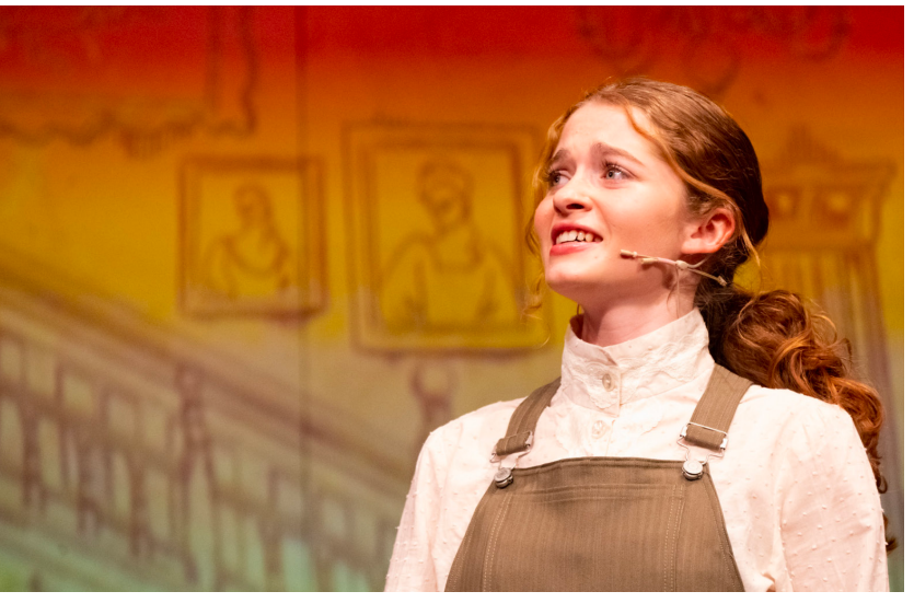
CTC's Beauty and the Beast