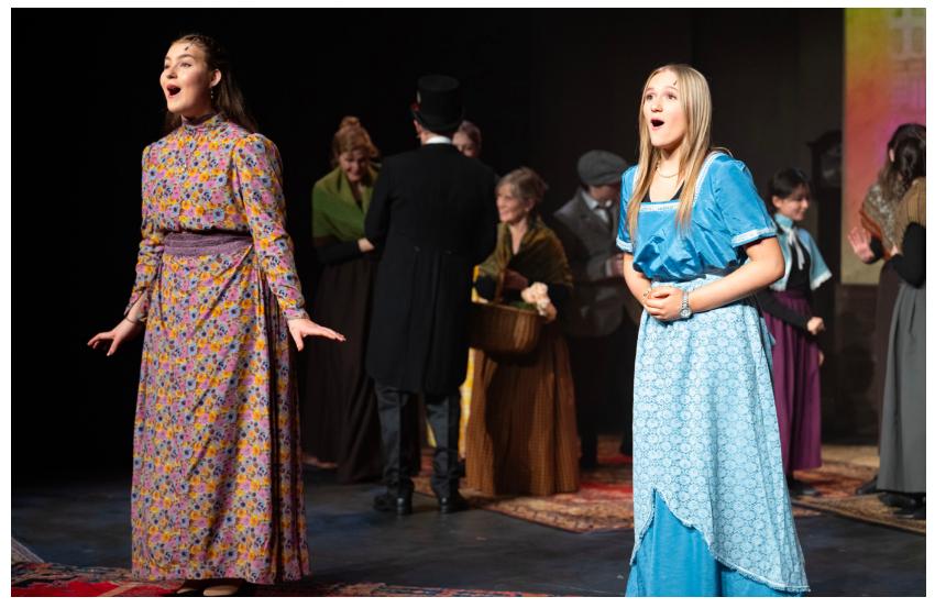
CTC's Beauty and the Beast