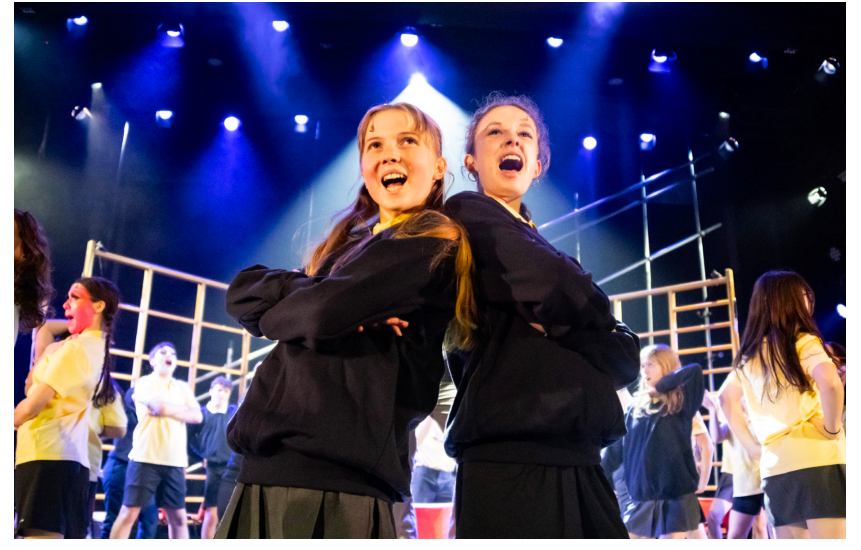
CTC's Everybody's Talking About Jamie: Teen Edition

CTC will provide costumes; participants will be asked to provide some basic elements of their costume that hopefully can be found easily at home or from a charity shop etc.